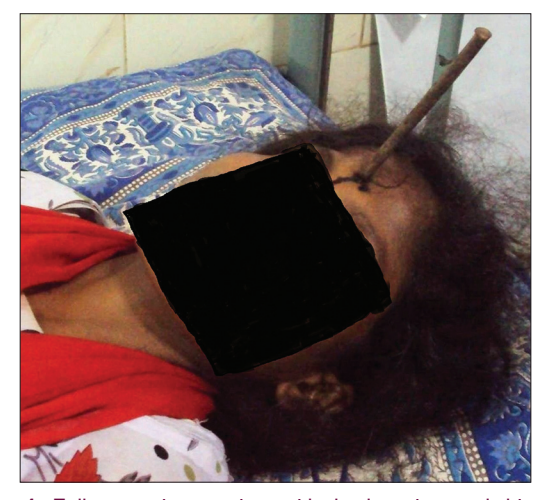
Figure 1: Fully conscious patient with the long iron rod driven into her forehead

A 19-year-old female presented to us with an iron rod penetrating into the center of the lower part of forehead in the glabellar region. Her history revealed a very strange incidence in which she held the iron rod by her both hands and hammered the head forcefully against it. She was fully conscious with no focal neurological signs. The patient was completely apathetic to the pain of such trauma [Figure 1]. Plain X-ray of skull showed about 5 inches of iron rod penetrating through the anterior skull base into the cranial cavity [Figure 2]. CT scan showed the same picture with no parenchymal damage or extra-axial blood collection [Figure 3]. A wide craniotomy centering on the entry point of the