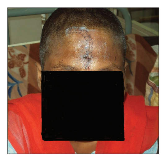
Figure 5: Postoperative picture showing the scar site

facts make this act almost impossible for a normal individual. However, the psychotic patients as in this present case who are under the influence of certain commands directing them to do certain specific acts have strong impulsive behavior, no insight, and complete apathy to pain to execute difficult manoeuvres so as to inflict such injuries on themselves. Psychologically