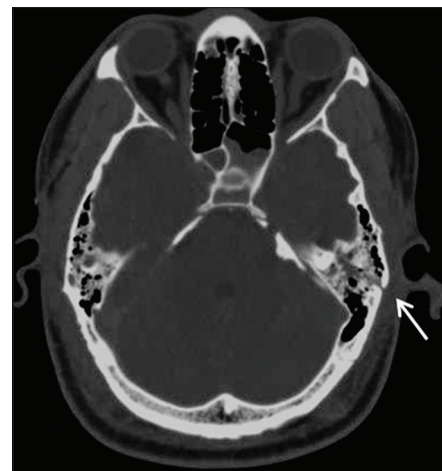
Figure 2: Axial CT image showing a longitudinal fracture of the left petrous bone (arrow)

The mechanism of injury was uncertain in majority of the cases [73 (56.2%)]. However, more than one in five cases [28 (21.5%)] resulted from a coup mechanism, while the contrecoup mechanism of injury accounted for 7.7% (10/59) and both mechanisms were reported in 19/130 (14.6%) cases. Coup injuries occur at the site of impact, i.e. the intracranial hemorrhage being on the same side as the fracture or soft tissue swelling. The contrecoup injury occurs at the opposite side or at the rebound site of impact. Among patients with CT diagnosis of BSF, the coup mechanism was the most