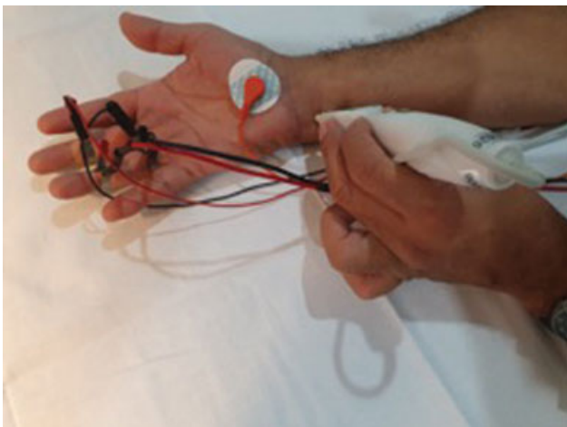
Fig. 1 Arrangement of the recording electrodes and the stimulator for the investigation of the Berrettini's connection.

A descriptive statistical analysis of the following variables was performed: gender, left or right handedness, and the Berrettini percentage.