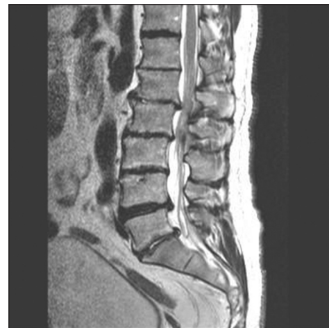
Figure 4: A sagittal view of T2-weighted MRI of lumbar spine showing moderate degenerative disc disease at L1-2, L2-3, L4-5, L5-S1