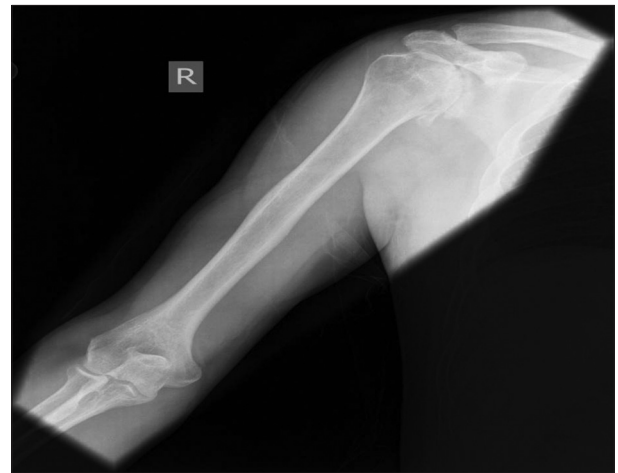
Figure 2: An X-ray of right shoulder showing markedly advanced degenerative change with substantial narrowing of the glenohumeral joint space, significant sclerosis and subchondral cyst formation