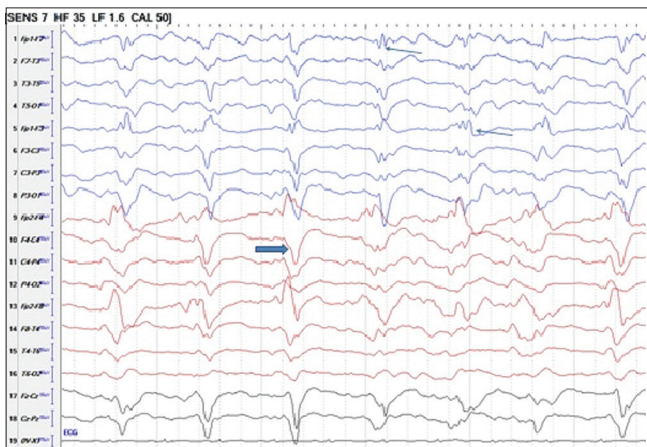
Figure 3: 50-year-old man with ethanol related chronic liver disease with HE. His EEG revealed generalized periodic discharges of triphasic waves (thick arrow) superimposed with seizure discharges (thin arrows). HE: Hepatic encephalopathy.

3. There is fronto-occipital time lag and whole T-wave complex lasts 0.32 s on average. [6] These morphologic distinctions may help differentiate TWs from GSWCs. [Table 1] explains the differences between SWCs and T-waves.