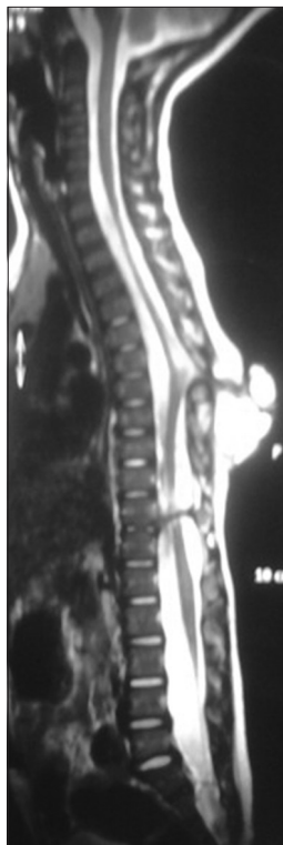
Figure 3: T2W MRI image showing hyperintense myelocystocele sac extending from D7-D10 level, with complete spur at D11 level, also noted is the syrinx at D6 level, low-lying tethered cord at L3 level