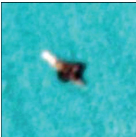
Figure 5: Operative photograph of the bony spur