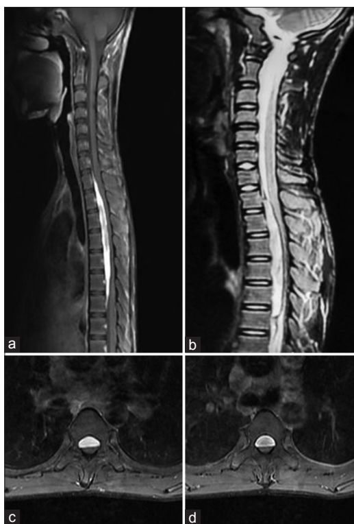
Figure 1: (a) T1-weighted magnetic resonance imaging dorsal spine sagittal cuts, (b) T2-weighted sagittal cuts, (c and d) T2-weighted axial cuts showing a ventral spinal epidural hematoma extending from D1 to D6 vertebra and displacing and compressing the cord posteriorly