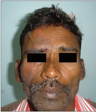
Figure 1: Thickened right supra orbital nerve