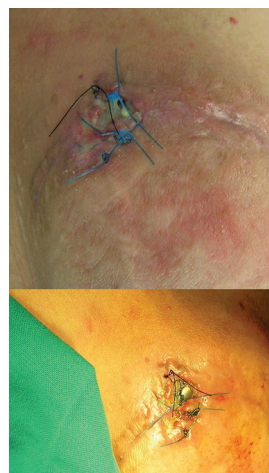
Figure 2: Local infection and extrusion of the implantable pulse generator 18 days' postimplantation