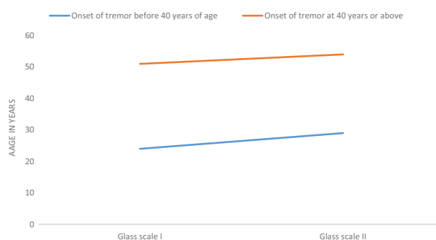
Figure 2: Rate of progression of disease to Glass Scale Score II from Glass Scale Score I according to the age of onset of tremor