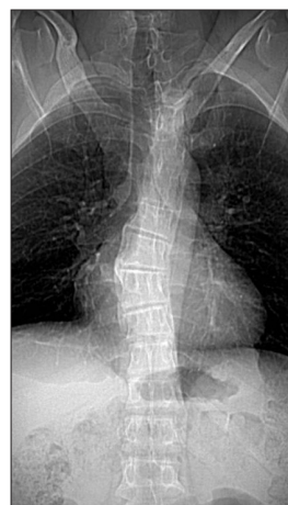
Figure 1: Topogram of the computed tomography (CT) scan dorsal spine revealing scoliotic curvature with convexity to left

Osseous hypertrophy of normal posterior elements causing symptomatic compression is rare. There are three case series with facet joint hypertrophy causing thoracic myelopathy. Barnett reported seven cases of thoracic