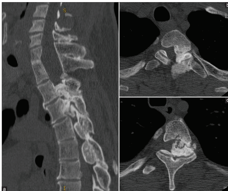
Figure 2: CT scan dorsal spine sagittal view (a) and axial sections at D2-3 level (b) and D3-4 level (c) showing ossified hypertrophied left D2-3 and D3-4 facet joints with canal stenosis