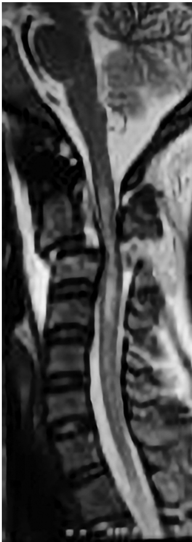
Fig. 3 Magnetic resonance imaging cervical spine sagittal section showing spinal canal narrowing and cord compression at C2 to C3 level with cord hyperintensity.