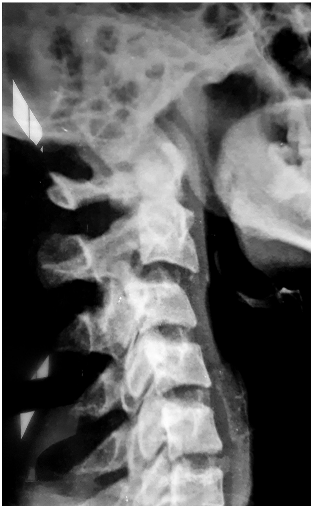
Fig. 1 Lateral radiograph of cervical spine showing C2 to C3 listhesis.

Postoperative imaging showed reduction in the listhesis with restoration of the integrity of spinal canal (► Fig. 5 ). Postoperative period was uneventful with improved power in bilateral upper limbs (bilateral MRC grade 4/5) at discharge. Six weeks follow-up showed a recovering neurological trend with physiotherapy.