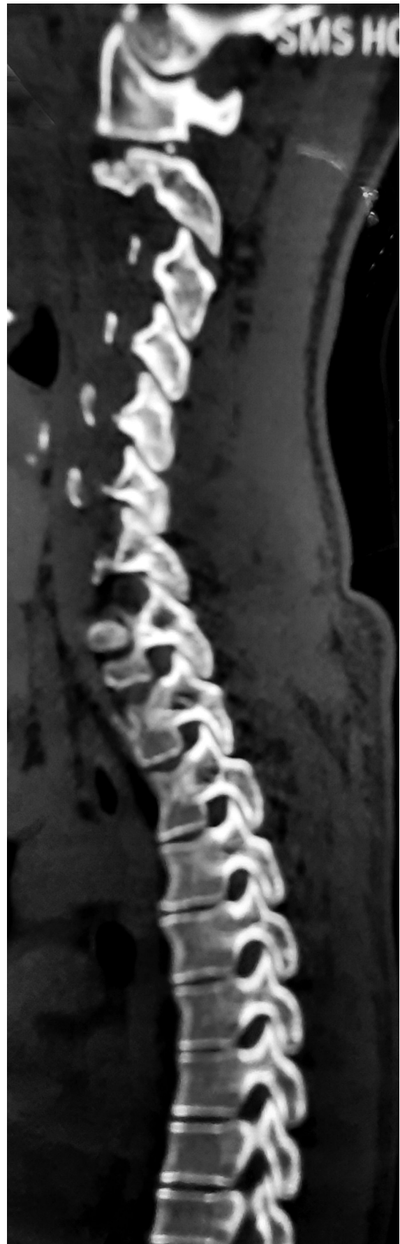
Fig. 2 Computed tomography cervical spine, sagittal view showing the C2 to C3 facet joint showing no pars fracture.

Traumatic spondylolisthesis of the axis is caused by failure of pars interarticularis with consequent separation from the C2 vertebral body and resulting anterior slippage of the C2 over the C3 vertebra. It is typically attributed to a hyperextension or hyperflexion injury causing bending moment to the vertebra body and pedicle, causing fracture at the weakest part, that is, pars interarticularis. Burke and Harris defined atypical HF as those involving the posterior aspect of the vertebral body instead of those involving the neural arch. 5 Compared with classical type, atypical fractures are also more likely to have neurological deficits. The Effendi classification, modified by Levine, is the most prevalent classification system in use for these fractures but its most important criticism is the lack of incorporation of soft tissue