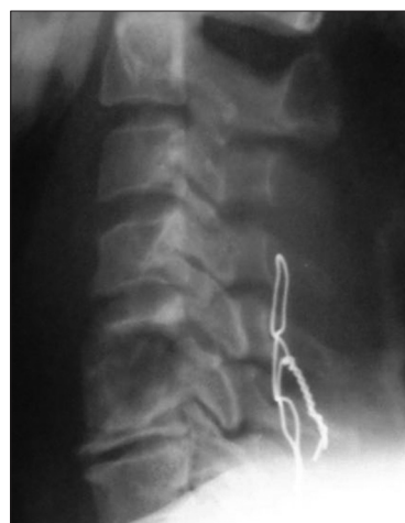
Figure 1: Cervical spine X-ray [lateral view] of a patient who had interspinous wire (Rogers technique [6] ) after an anterior corpectomy with no evidence of canal penetration