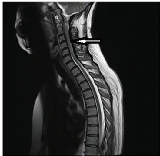
Fig. 2 Sagittal T2 magnetic resonance imaging of the cervical spine showing improvement in the thickening of the dura mater after steroid therapy.

and chronic progression. Chronic HP of the spine is caused by inflammation of the dura mater. Typically, it involves the cervical and thoracic spine areas. 4