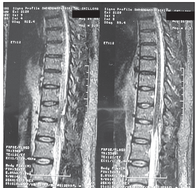
Figure 2: MRI spine showing compression of the cord and conus medullaris