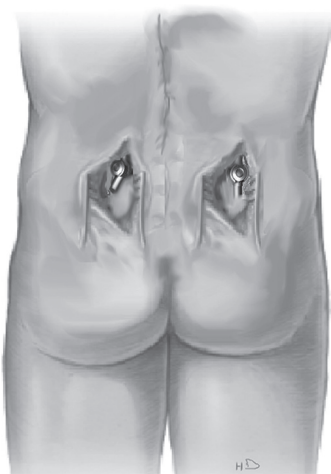
Figure 3: An illustration of bilateral paramedian incisions depicting exposure of only the lower end of the long segment fusion construct to facilitate sacroiliac fixation

Despite advances in techniques of lumbosacral fixation, pseudoarthrosis at the lumbosacral junction is not an uncommon problem. This is partly due to a large pedicle of the sacrum which often provides less rigid fixation