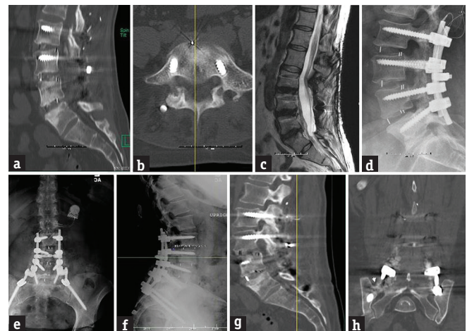
Figure 2: Preoperative (a and b) computed tomography scan and (c and d) magnetic resonance imaging of a patient with a previous lumbosacral fusion with evidence of pseudoarthrosis. (e) Anteroposterior and (f) lateral postoperative radiograph after minimally invasive extension of the fusion to the pelvis. Six months' postoperative (g) sagittal and (h) coronal computed tomography scan showing evidence of fusion from the pelvis to L5