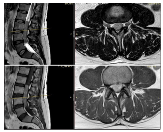
Figure 1: (a) Sagittal and axial lumbar MRI images. T2 noncontrasted sequence showing low T2 signal-intensity intradural/ extramedullary lesion extending from the lower aspect of L2 to L4-L5 disc level. (b) Sagittal and axial T1 contrasted image showing diffuse homogenous enhancement of the lesion. L: Lesion, T1W: T1-weighted MRI image without contrast, T2W: T2-weighted MRI image without contrast, TSE: Turbo spin echo, MDC: Mezzo di contrasto (contrast agent), AX: Axial, P: Posterior, R: Right, L: Left.

Histological examination of hematoxylin and eosin slides showed fragments of dense connective tissue populated by a proliferation of undifferentiated small round cells with irregular nuclei, high nucleus-to-cytoplasm ratio, sparse chromatin, and either absent or clear cytoplasm [Figure 2]. Rare mitotic figures were present as well (2/10 High-Power Field).