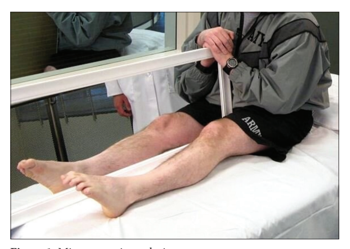
Figure 1: Mirror exercise technique.

Daily exercises included foot rotation from heel to toe, forefoot rotation, finger bending and straightening, foot tapping, and writing numbers in the air with the foot. Based on power analysis using G*Power software (version 3.1.9.7, Dusseldorf, Germany) and assuming the mean value and standard deviation from the study by M. Yildirim and