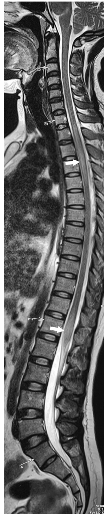
Fig. 2 Sagittal T2 MRI showing hyperintense signal in D1 to D4 thoracic segments and conus medullaris (arrows). MRI, magnetic resonance imaging.

Long segment transverse myelitis was the presentation in two patients (33.3%). Urological symptoms due to involvement of conus medullaris were seen in both the cases and are thought to be a characteristic feature of MOG antibody disease. 12