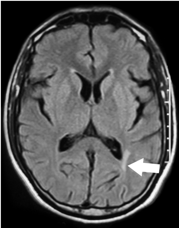
Fig. 1 Axial T2 FLAIR MRI showing hyperintense lesion in periventricular white matter of left occipital lobe (arrow). FLAIR, fluid-attenuated inversion recovery; MRI, magnetic resonance imaging.